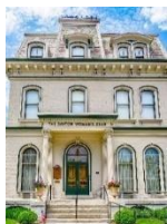
The Woman's Club of Dayton Foundation (DBA The Dayton Woman's Club)

225 N. Ludlow St Dayton OH 45402 937-228-1124 daytonwomansclub.org